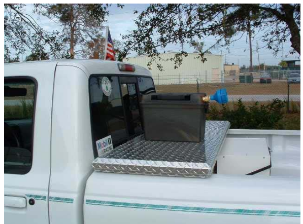
Connection to vehicle cigarette lighter for 12VDC or sampling applications