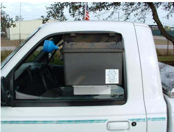
Air Sampler on window bracket

Cigarette Lighter Cord stores in Compartment accessible from outside.