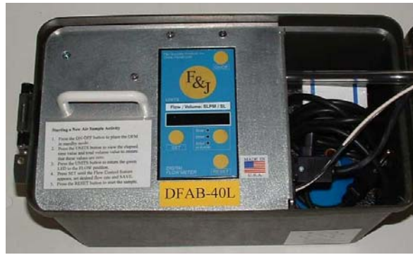
View of Inside